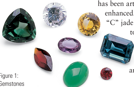
Figure 1: Gemstones

There are three classes of jadeite jade now commonly available. 1 "A" grade jade is totally natural (jadeite), and has the highest true market value. The "B" material has been treated as discussed below, and "C" grade material