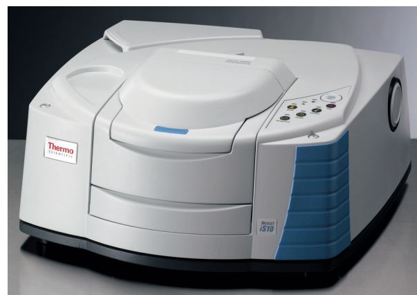
Figure 2: The Thermo Scientific Nicolet™ iS™10 spectrometer is ideal for gemstone analysis

The data were collected using the Thermo Scientific OMNIC™ software. A small number of scans was needed (4-16) to see the presence of resin; the spectra shown here were collected over a longer time (64 scans) to improve the s/n ratio. A resolution of 4 cm -1 was easily sufficient. The full spectrum was obtained, but the glassy nature of the material obscured all signals below 2300 cm -1 ; the critical range is between 2600 and 3800 cm -1 , so this is no impediment to the analysis.