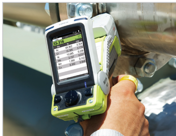
An inspection is conducted using the handheld Thermo Scientific Niton XL5 XRF analyzer.

As a result, it has become industry convention when inspecting for FAC to closely monitor trace alloy content. Further, monitoring of trace alloy content helps you facilitate improved planning of inspection protocol. For example, if inspected piping contains sufficient chromium content, it might be possible to omit it from future FAC inspection. The composition data also assists in interpreting the inspection data because it can be entered into EPRI CHECWORKS™ software improving the overall FAC data model.