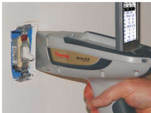
Thermo Scientific Niton XRF analyzers are ideal for the elemental analysis of drywall.

For the purpose of direct comparison of handheld XRF results with laboratory data, three certified gypsum standards were measured using a Niton ® XL3t in Mining Mode. Samples were placed in standard 32 mm XRF sample cups, covered with mylar film, and analyzed for a total of 210 seconds (30 s main, 30 s low, 30 s high, 120 s light). Analysis time and filter requirement depends on analysis goals. For rapid screening, an analysis of 30 seconds or less may be acceptable. An additional set of measurements was performed as follows: cupped samples were covered with a single sheet of drywall paper and analyzed to determine how quickly the three samples could be sorted based on their elemental concentrations. The measurement was repeated again, replacing the sheet of drywall paper with a sheet of painted drywall paper (single coat of latex paint over primer).