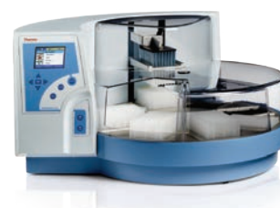
KingFisher Flex Purification Instrument

Manual sample preparation for lower throughput (throughput dependent on centrifuge capacity), semi-automated sample preparation processing with Applied Biosystems™ BeadRetriever™ Instrument (suitable for processing 15 samples per run) and Thermo Scientific™ KingFisher™ Flex Instrument (suitable for processing up to 96 samples per run).