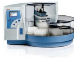
KingFisher Flex Purification Instrument