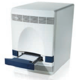
Applied Biosystems 7500 Fast Real-Time PCR Instrument

The kits are optimized for use in the Applied Biosystems™ 7500 Fast Real-Time System.