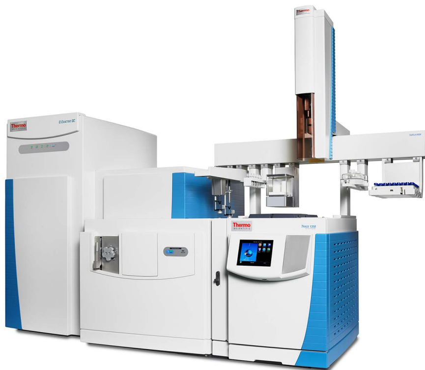
Figure 2. Q Exactive GC mass spectrometer with TriPlus RSH autosampler.