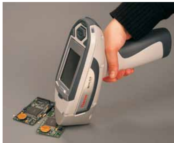
Screen toys, electronics, and consumer goods for prohibited substances with Niton XL3t Series XRF analyzers.

The small-spot focus feature, combined with the CCD camera, is ideal for positioning, analyzing, and documenting the analytical results of small components – something previously only achievable with benchtop XRF analyzers. The CCD camera displays a picture image of the sample on the instrument screen, which is stored along with the analysis data for easy reference, data management, and data integrity.