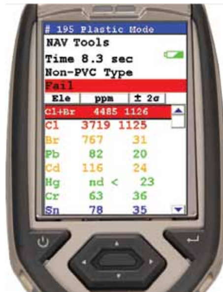
Here, the Cl+Br readings are over their respective thresholds, resulting in a "Fail."

The Niton XL3t 700 GOLDD is the ideal tool for screening toys, electronics, and consumer goods for