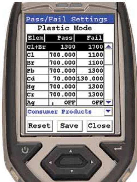
Users can set limits for pass/fail thresholds. For example, Br+Cl is set to 1500 +/- 200 ppm in plastics mode.

Adding significant analysis capability is our exclusive option of a variable analysis small-spot feature, which allows you to collimate the x-ray beam on individual areas as small as 3 mm. The small-spot analysis feature lets you switch “on the fly” between normal test mode