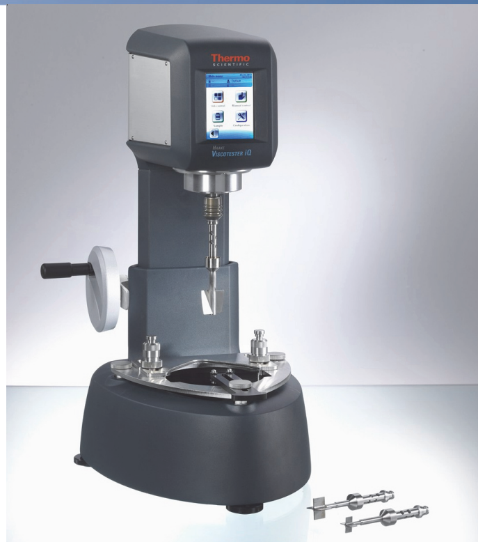
Fig. 1: Thermo Scientific HAAKE Viscotester iQ

With M being the maximum Torque and K the vane parameter that depends on the height (H) and the diameter (D)