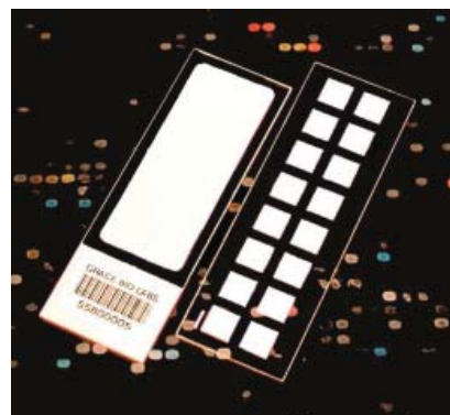
Figure 2. ONCYTE® nitrocellulose coated slides with 1 pad or 16 pads.